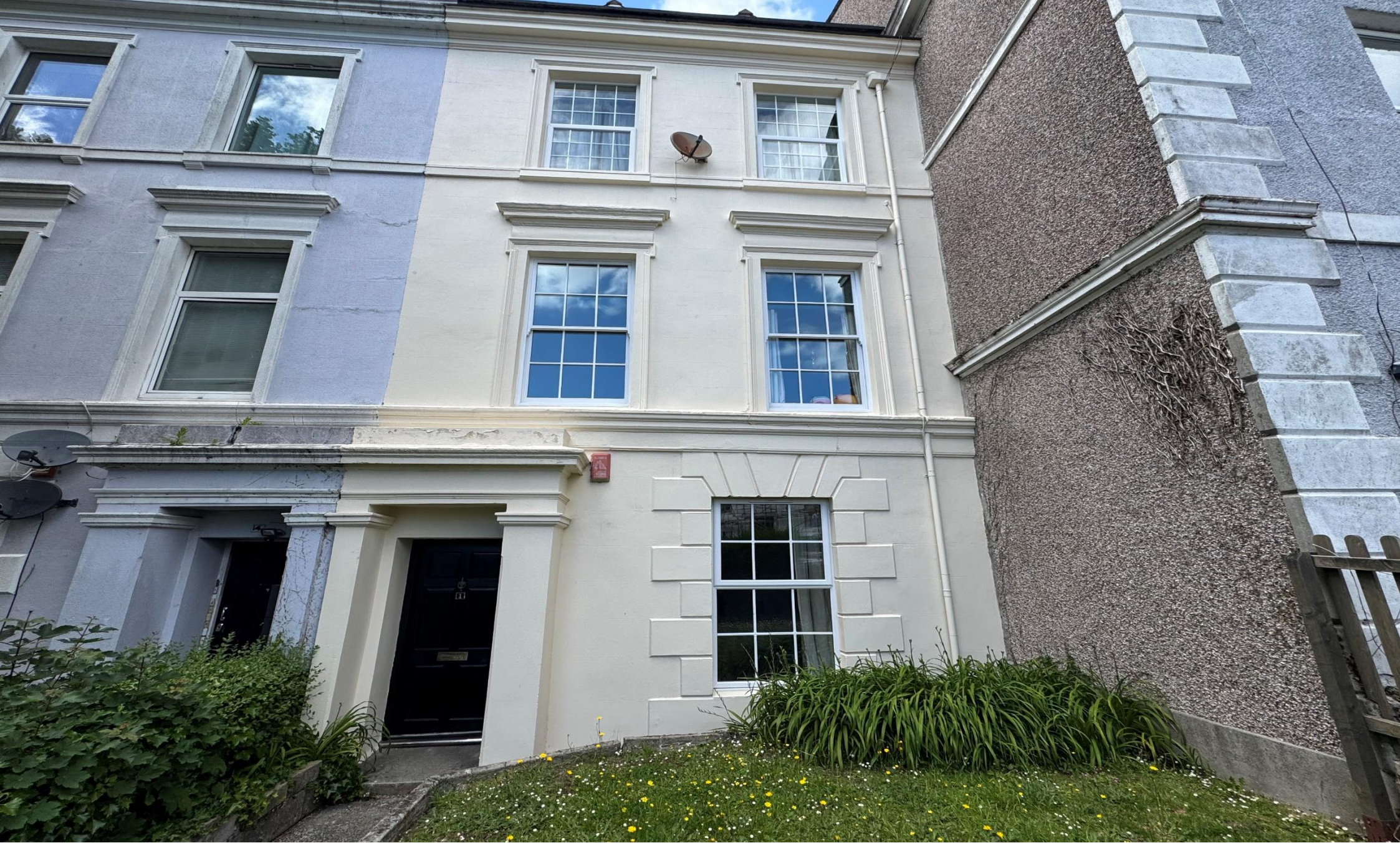
Ground Floor Flat, 12 North Road East, Plymouth, Devon, PL4 6AS