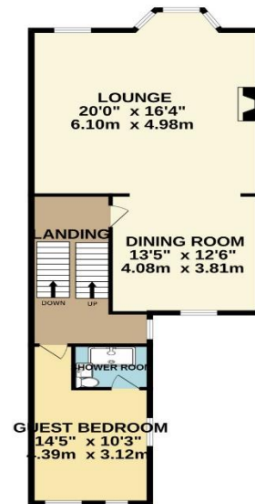
1ST FLOOR 929 sq.ft. (86.3 sq.m.) approx.