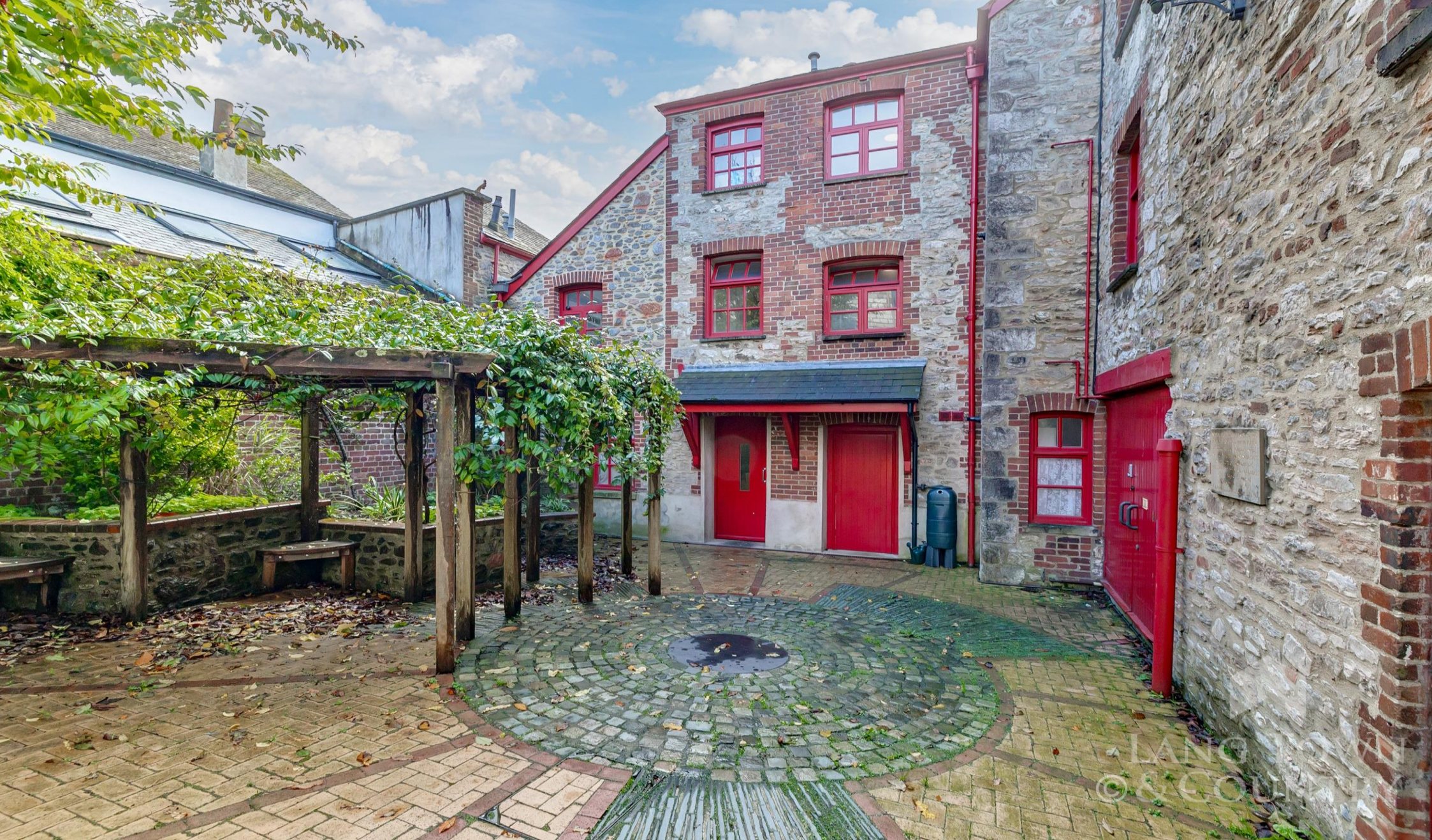
Astor Court, 54 Looe Street, Barbican, Plymouth, Devon, PL4 0EB