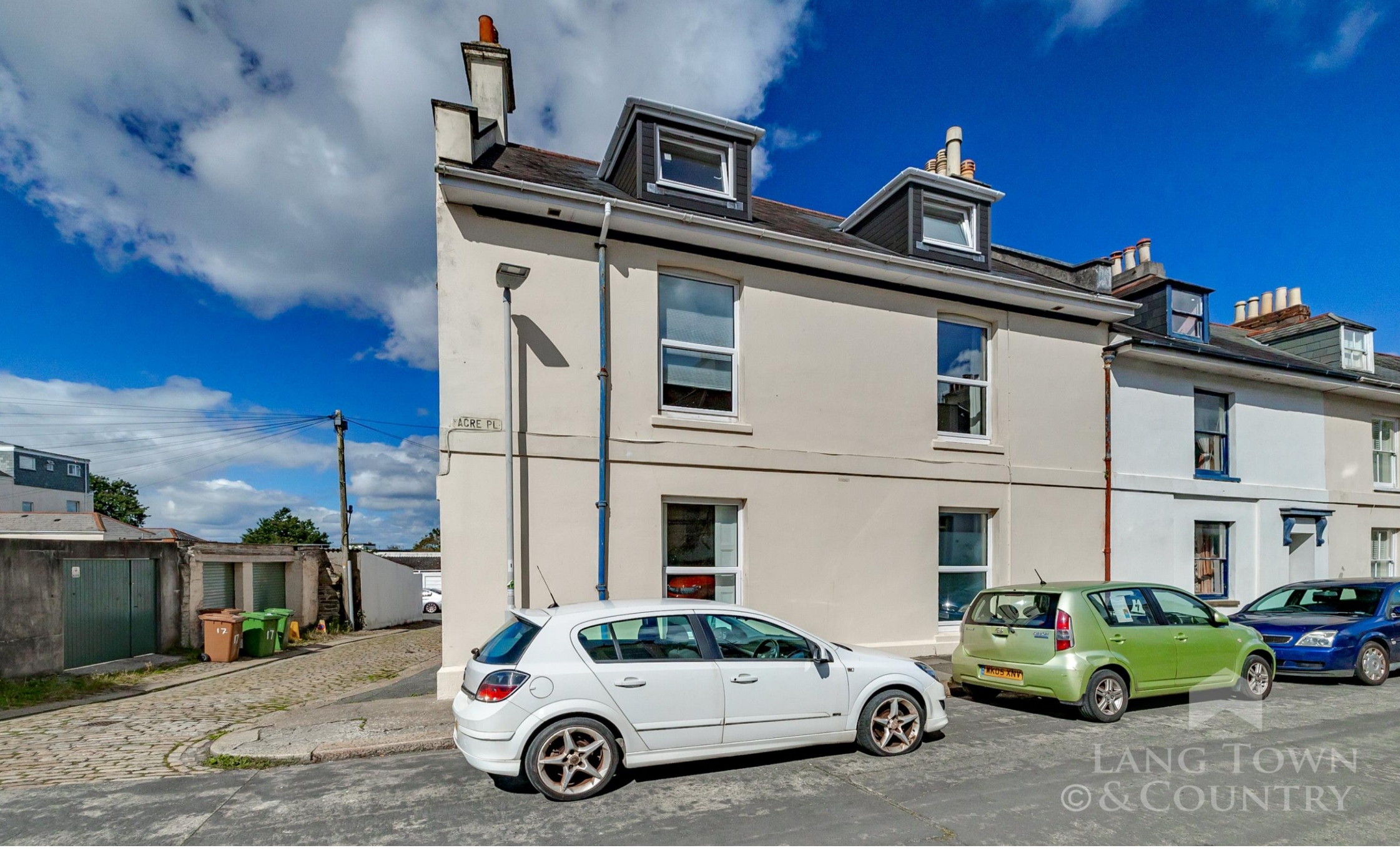
17 Acre Place, Stoke, Plymouth, Devon, PL1 4QR