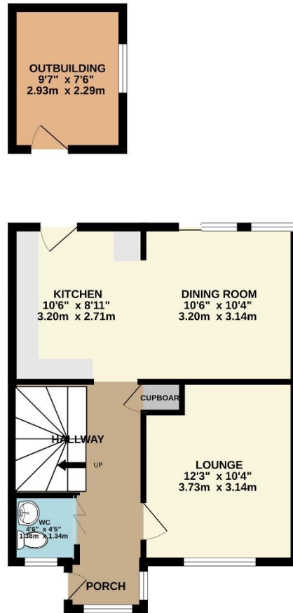
GROUND FLOOR 525 sq.ft. (48.7 sq.m.) approx.