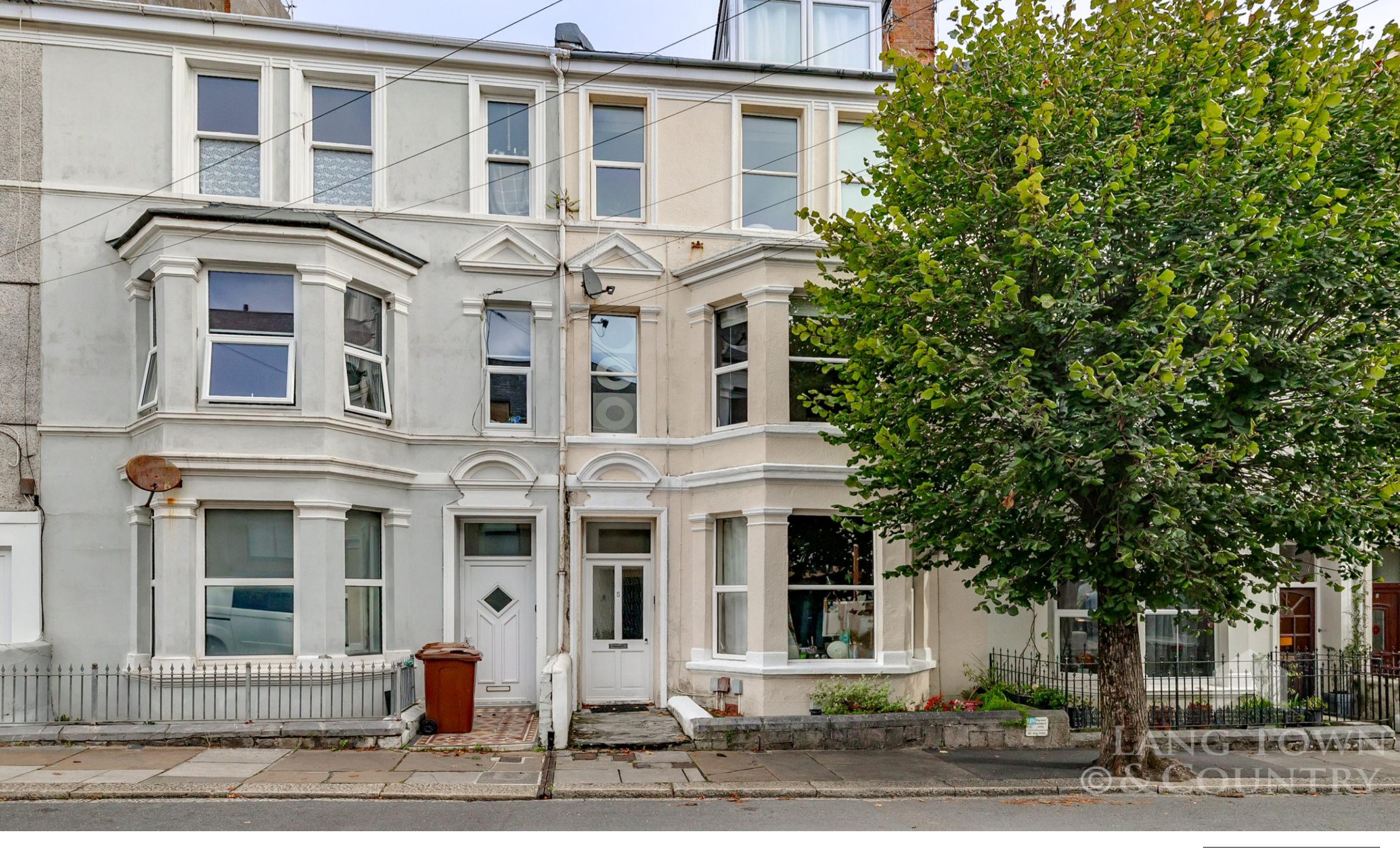
Flat 2, 5 Pier Street, West Hoe, Plymouth, Devon, PL1 3BS