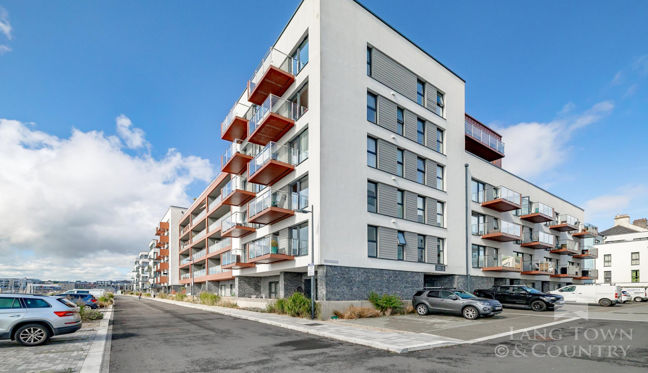
Flat 19, Aqua House, Kingdom Street, Plymouth, Devon, PL1 3GJ