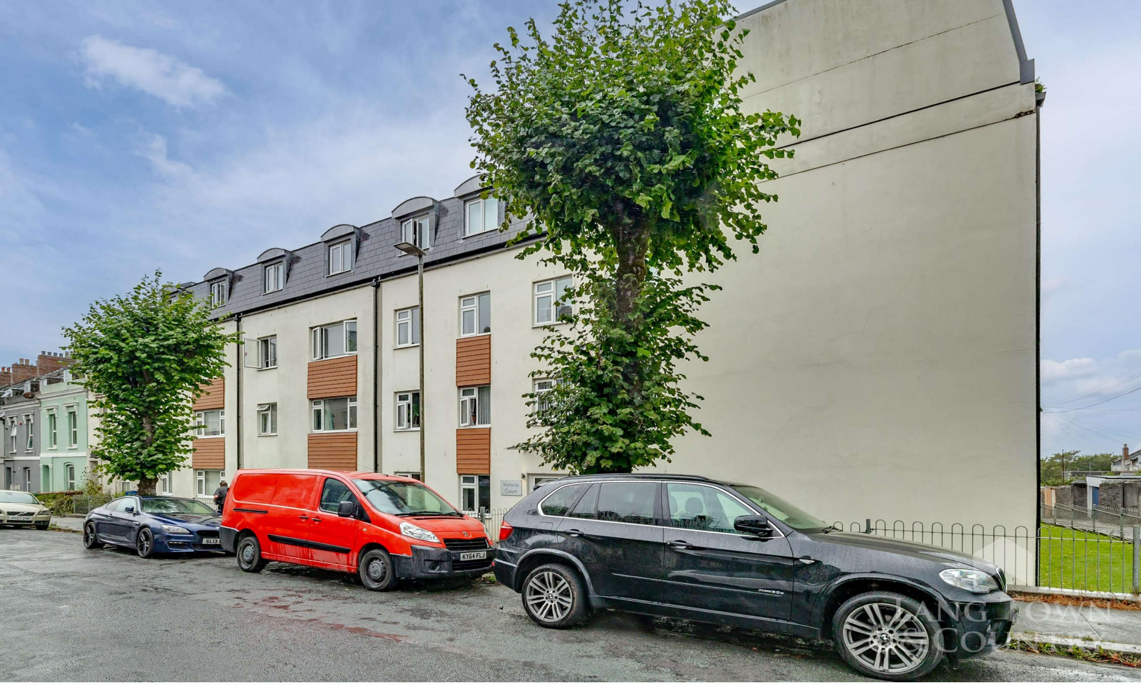
Flat 1 Victoria Court, 23 Victoria Place, Stoke, Plymouth, Devon, PL2 1BY