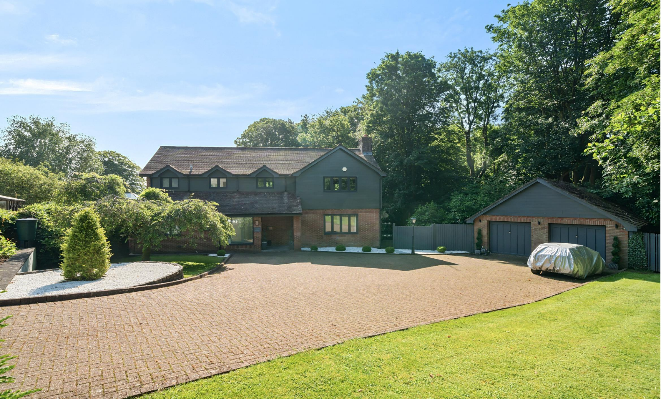
Ocean House, 4 Woodlands End, Glenholt, Plymouth, Devon, PL6 7RE