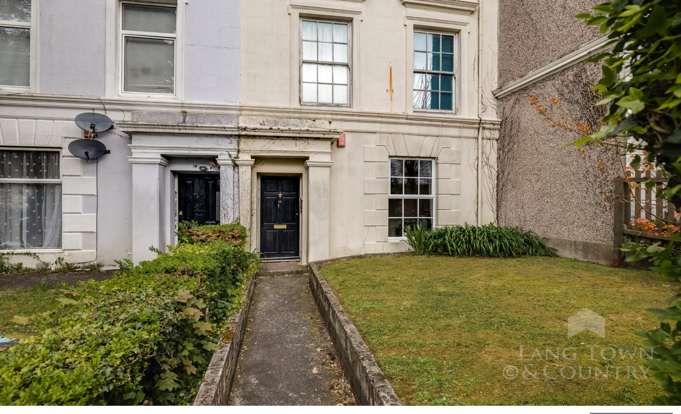
Ground Floor Flat, 12 North Road East, Plymouth, Devon, PL4 6AS