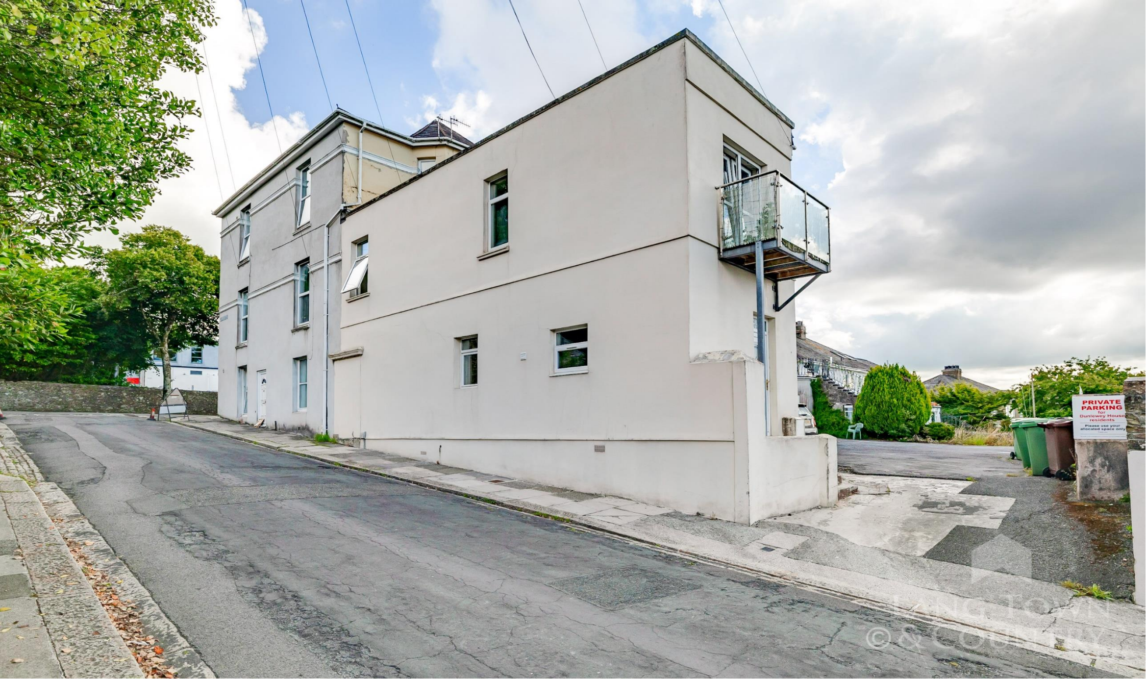
Dunlewey Cottage, Seymour Road, Mannamead, Plymouth, PL3 5AX