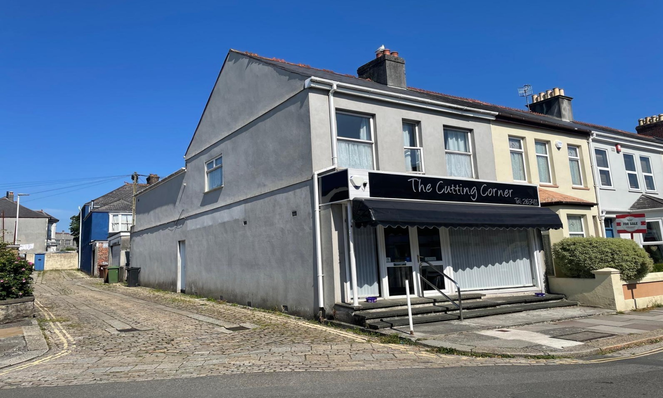
34 Gifford Place, Peverell, Plymouth, Devon, PL3 4JA