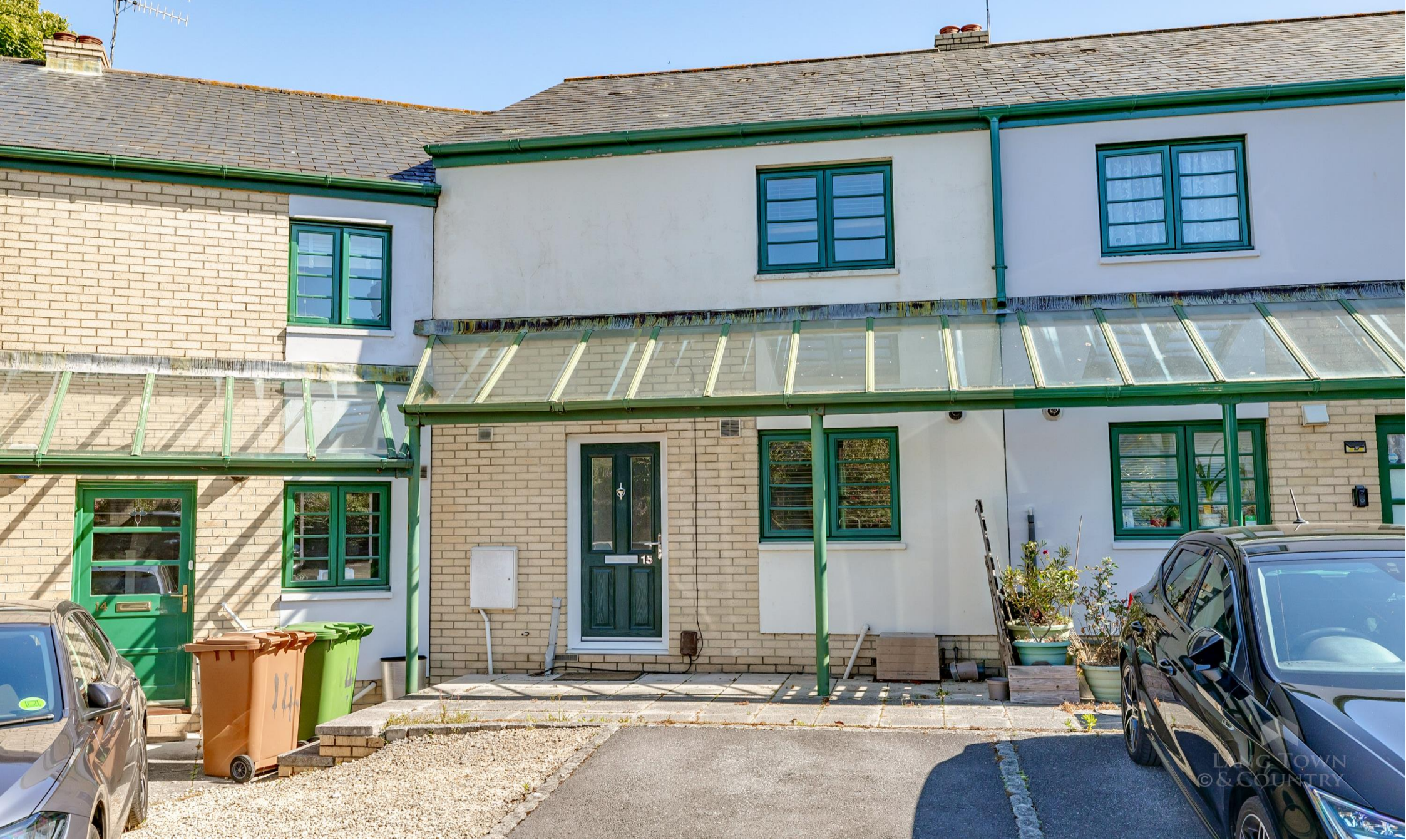
15 The Old Laundry, Millfields, Plymouth, Devon, PL1 3NL