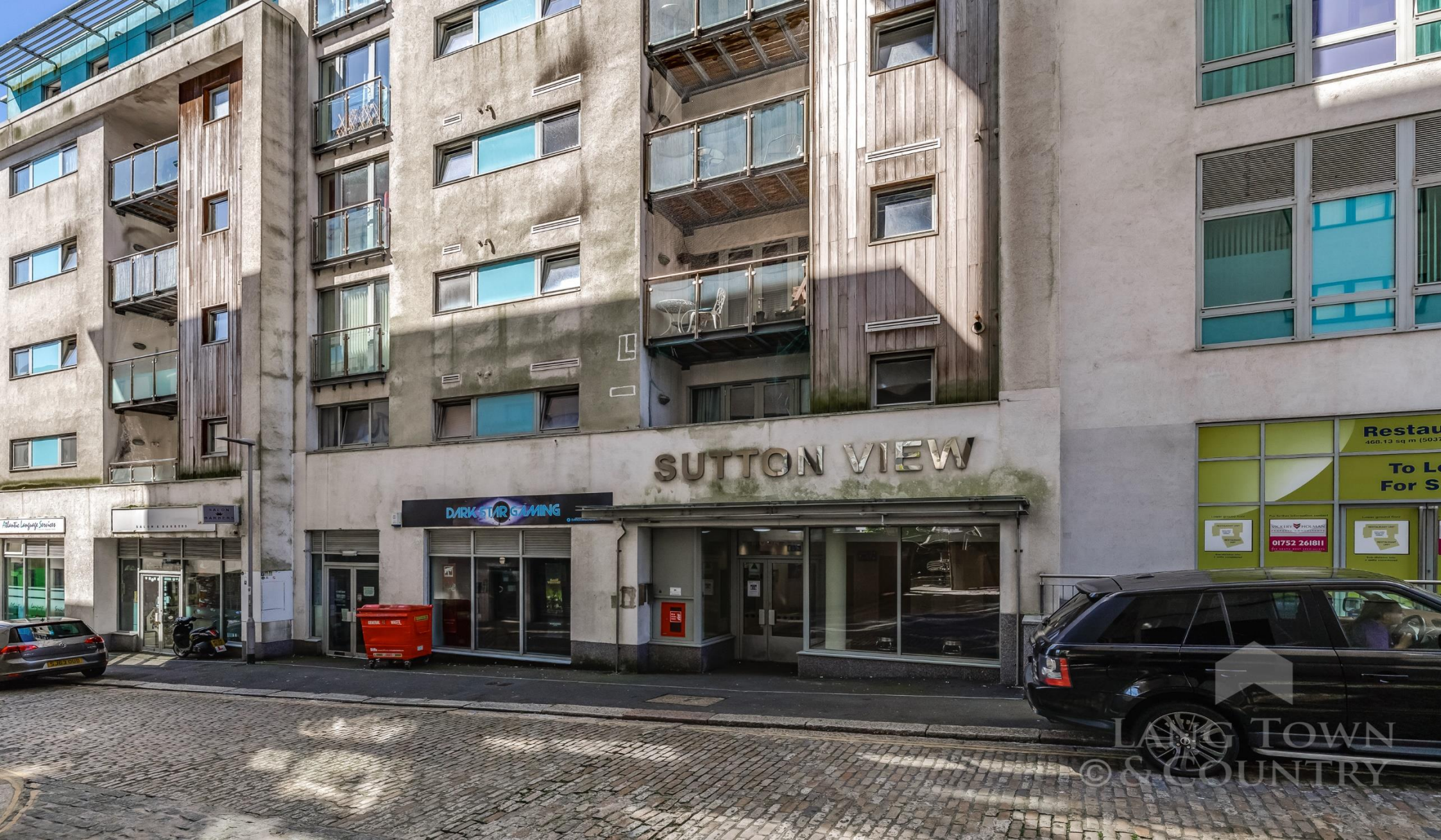
Flat 1, Sutton View, 11 Moon Street, Sutton Harbour, Plymouth, Devon, PL4 0AL