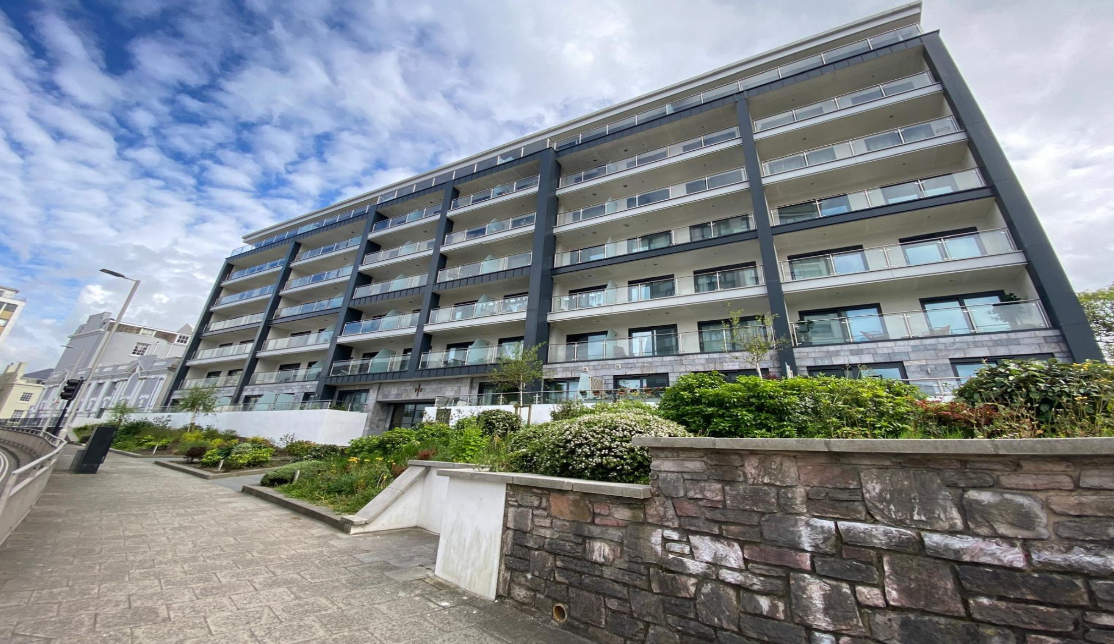
Peirson House, Apartment 34, 175 Notte Street, The Hoe, Plymouth, Devon, PL1 2BT