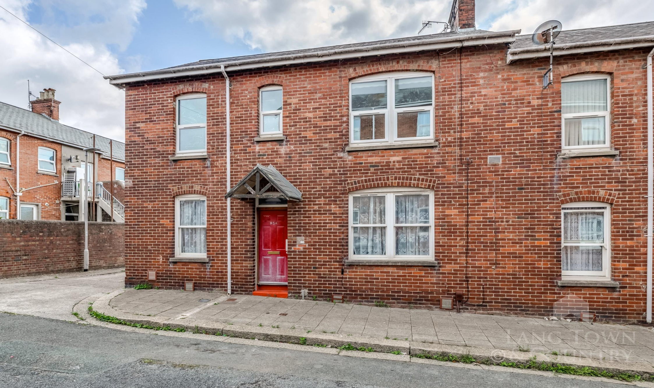
5b Williams Avenue, Prince Rock, Plymouth, Devon, PL4 9NX