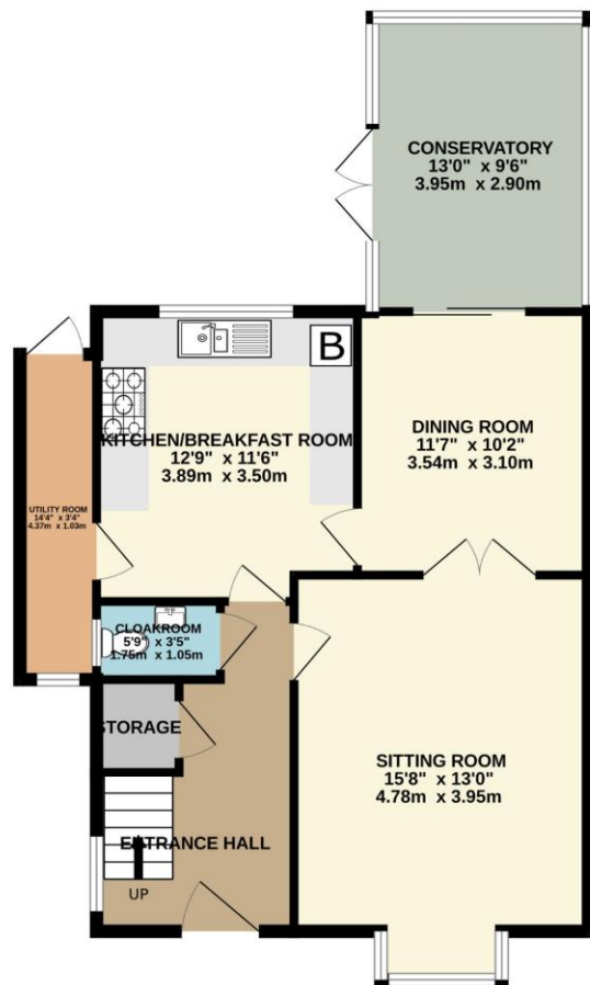
GROUND FLOOR 640 sq.ft. (59.5 sq.m.) approx.