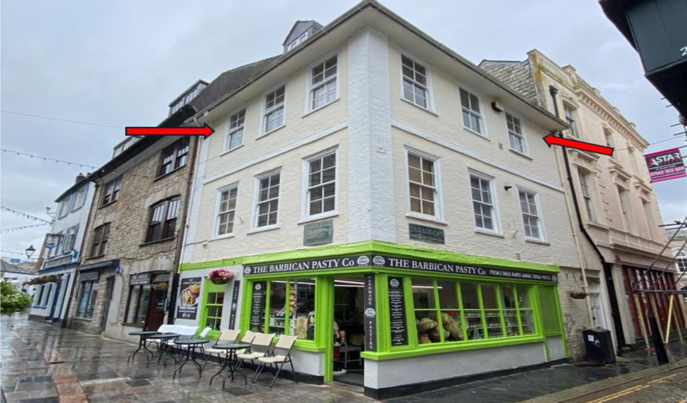
Top Floor Flat, 22 Southside Street, Barbican, Plymouth, Devon, PL1 2LD