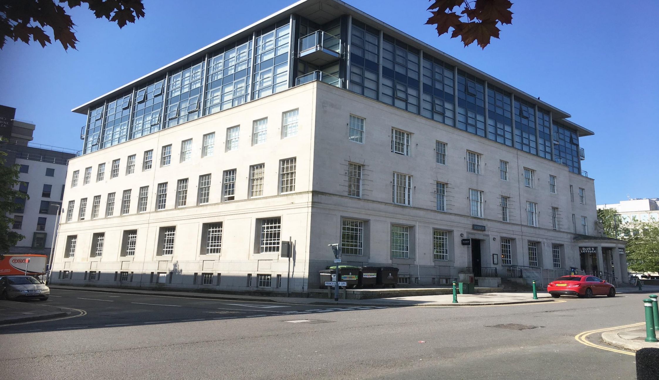
Flat 28 Berkeley Square, 33 Notte Street, Plymouth, Devon, PL1 2AZ