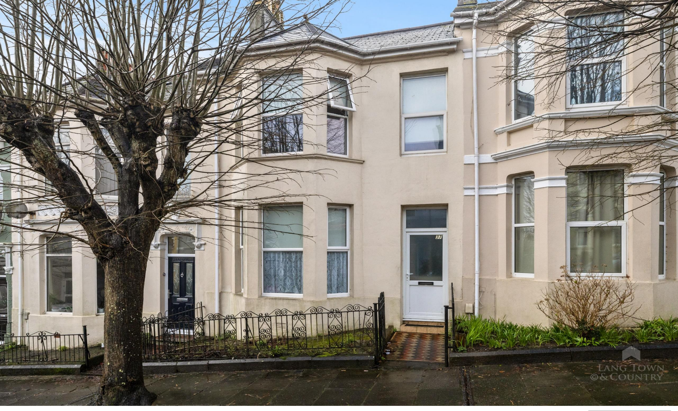
37 Seymour Avenue, St Judes, Plymouth, Devon, PL4 8RB