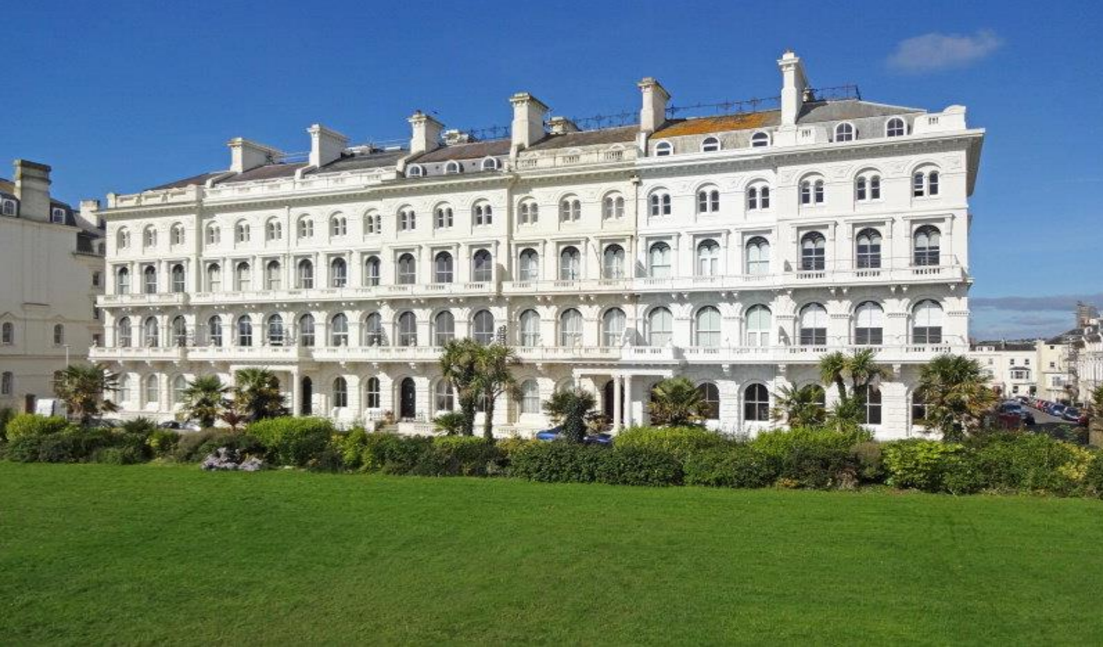
Apartment 5a, Elliot Terrace, The Hoe, Plymouth, PL1 2PL