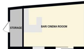
GROUND FLOOR 742 sq.ft. (68.9 sq.m.) approx.