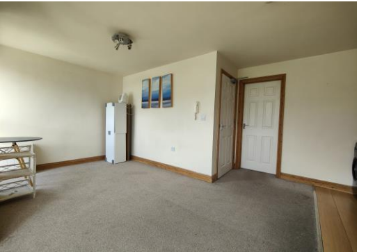
Flat 2, Sunset Apartments, Tower Road, Newquay, Cornwall, TR7 1FF

A SPACIOUS AND MODERN UPPER FLOOR ONE BEDROOM APARTMENT CLOSE TO TOWN AND FISTRAL BEACH, OFF STREET ALLOCATED PARKING, THE PERFECT INVESTMENT OR STARTER HOME- NO CHAIN!