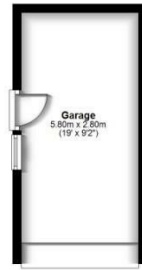
Ground Floor Approx. 93.5 sq. metres (1006.6 sq. feet)