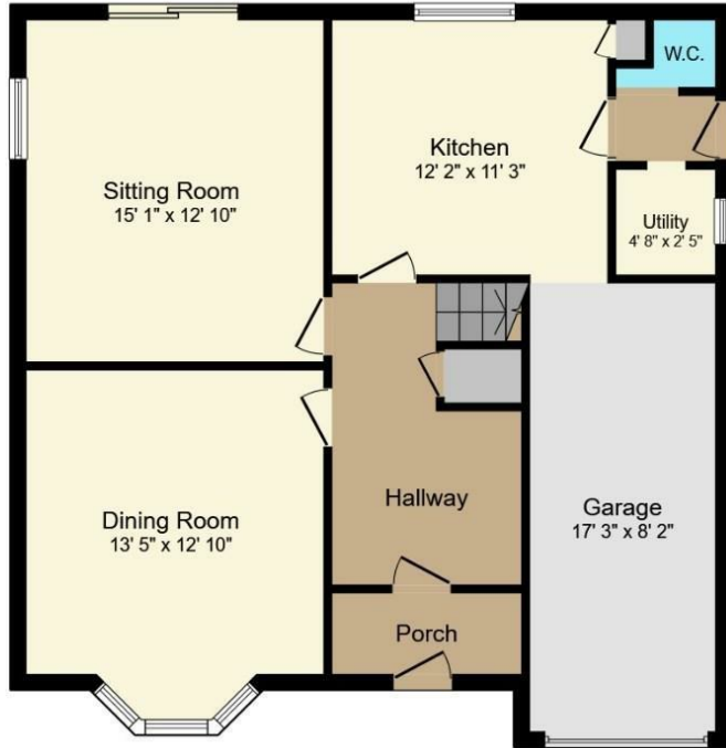
Ground Floor Floor area 906 sq.ft.