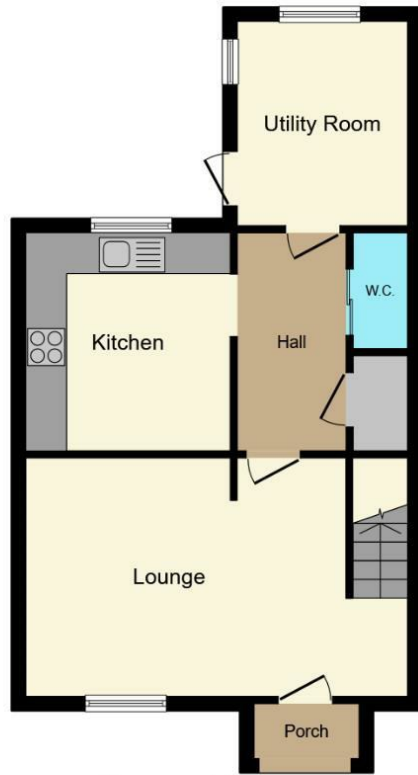
Ground Floor Floor area 47.2 m 2 (508 sq.ft.)