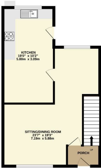
GROUND FLOOR 534 sq.ft. (49.6 sq.m.) approx.