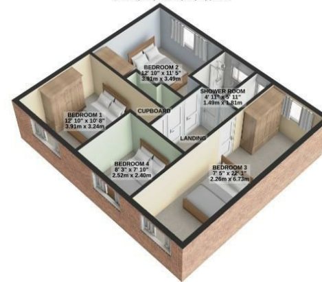
1ST FLOOR 566 sq.ft. (52.6 sq.m.) approx.