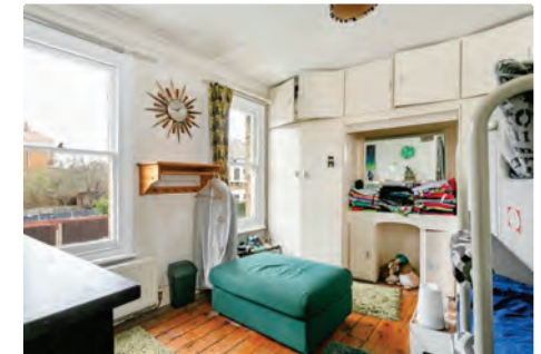
Living Room 14'9 x 12'11