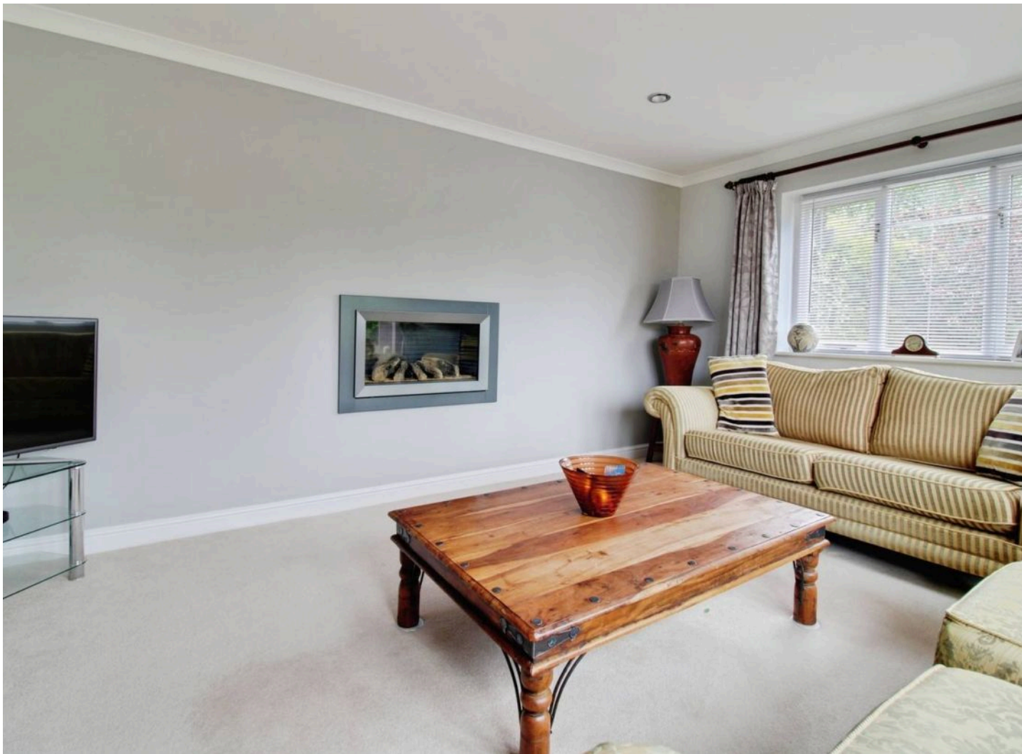
Becks Burycroft Wanborough, Swindon