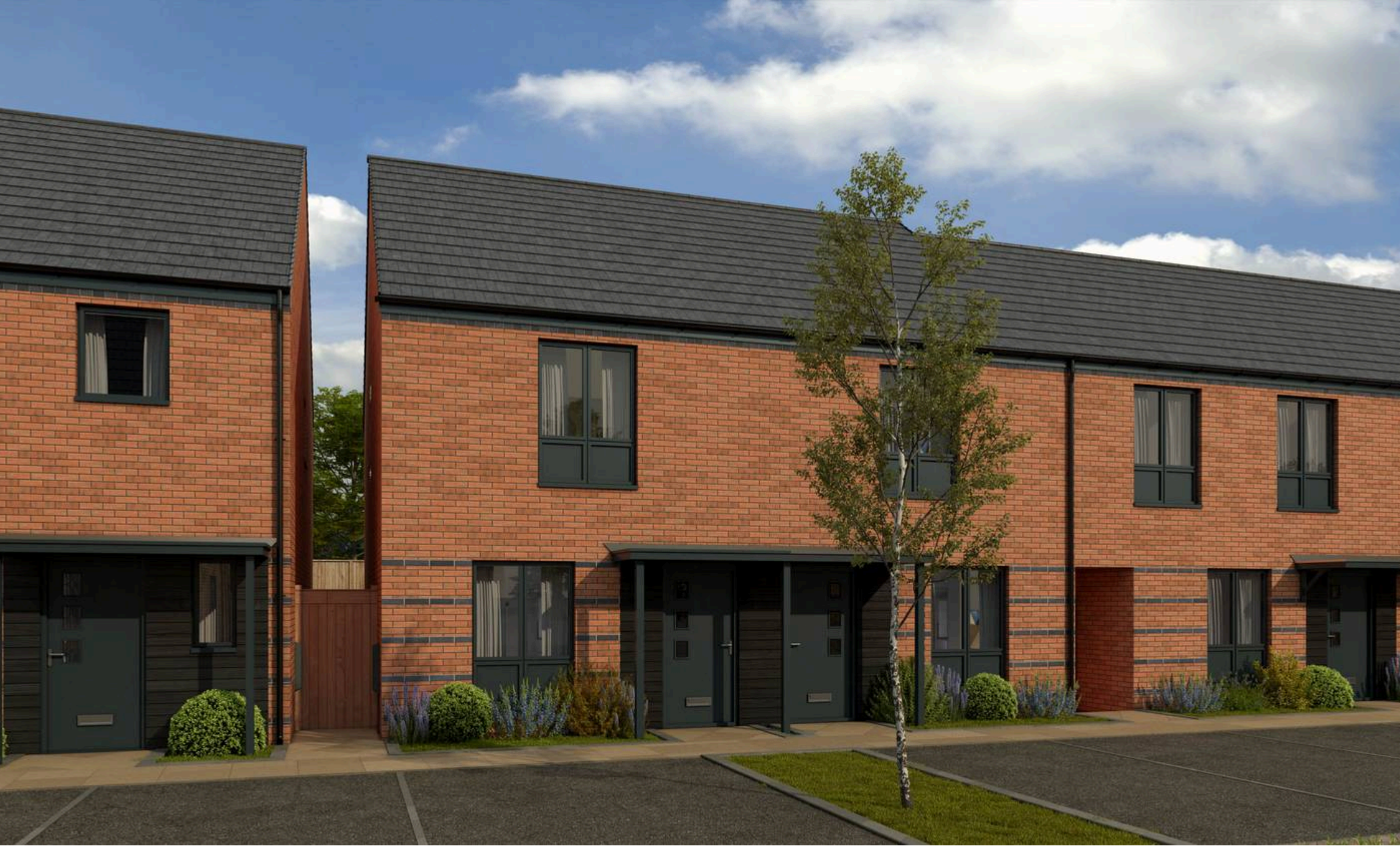
Bushmills, Western Gate, Marlborough Road Swindon