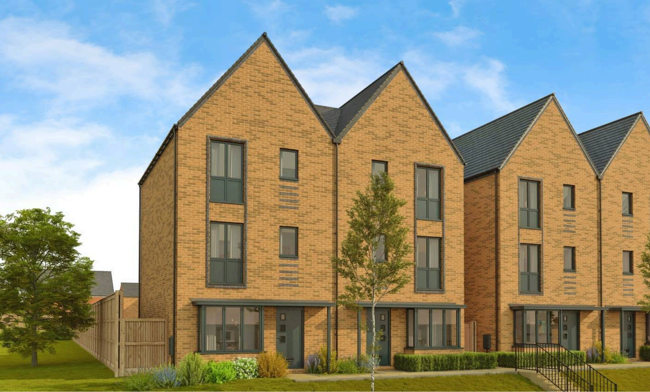
The Grange, Western Gate, Marlborough Road Swindon