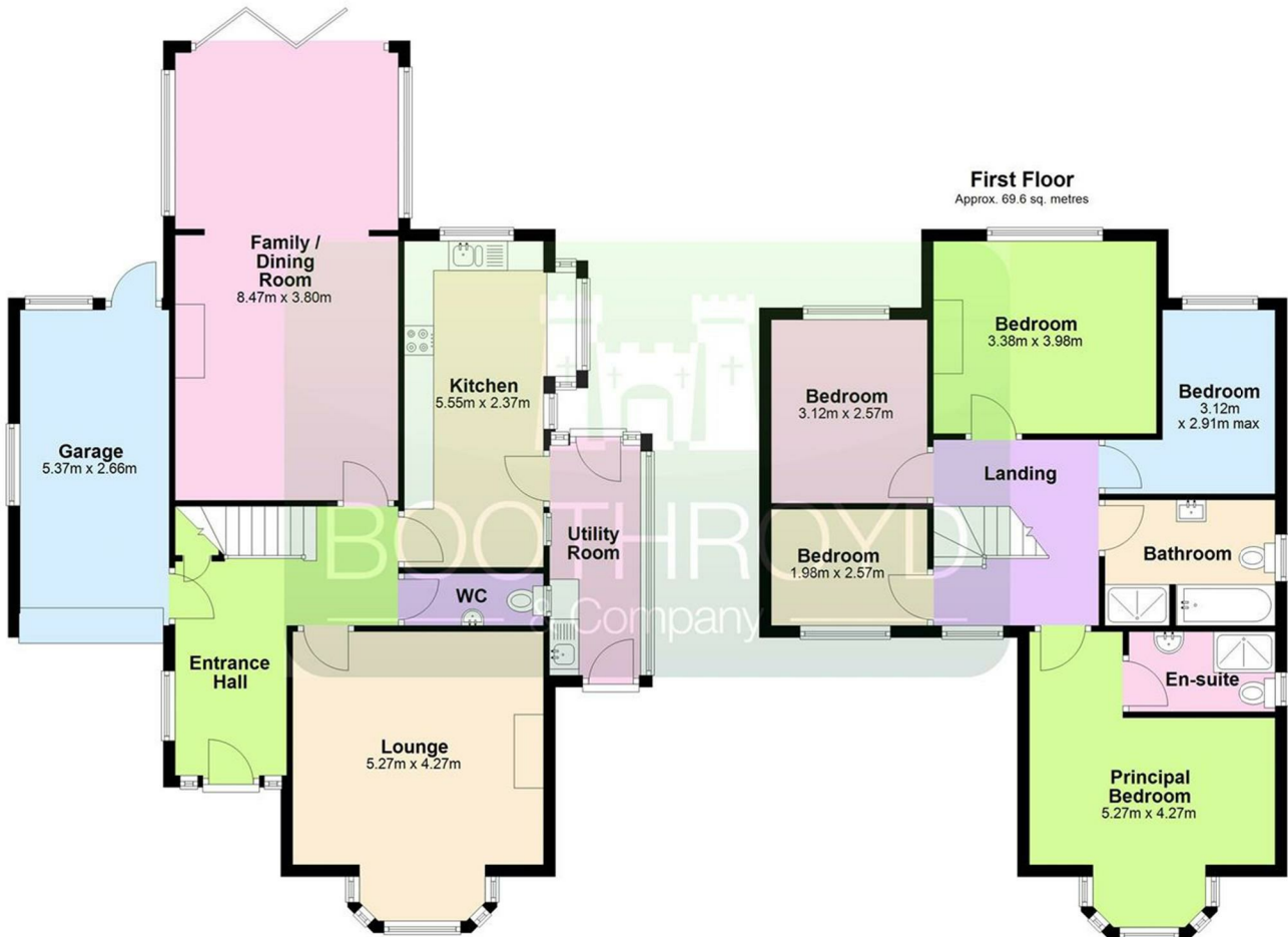
Ground Floor Approx. 99.2 sq. metres