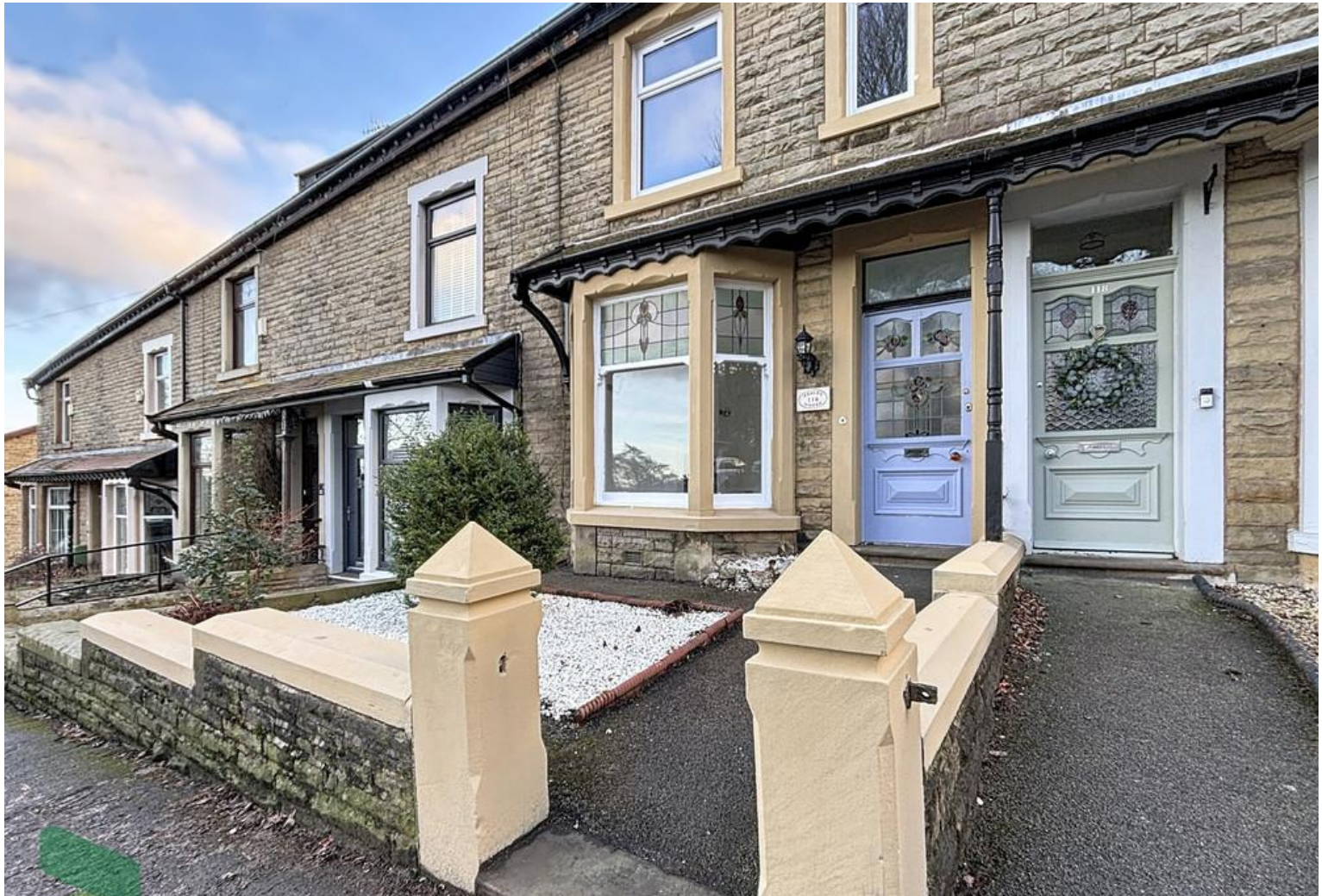
116 Earnsdale Road, Sunnyhurst Area, Darwen

238-240 Duckworth Street, Darwen, Lancashire, BB3 1PX Tel. 01254 705521 Email. darwen@proctorsestateagents.co.uk Web. proctorsestateagents.co.uk