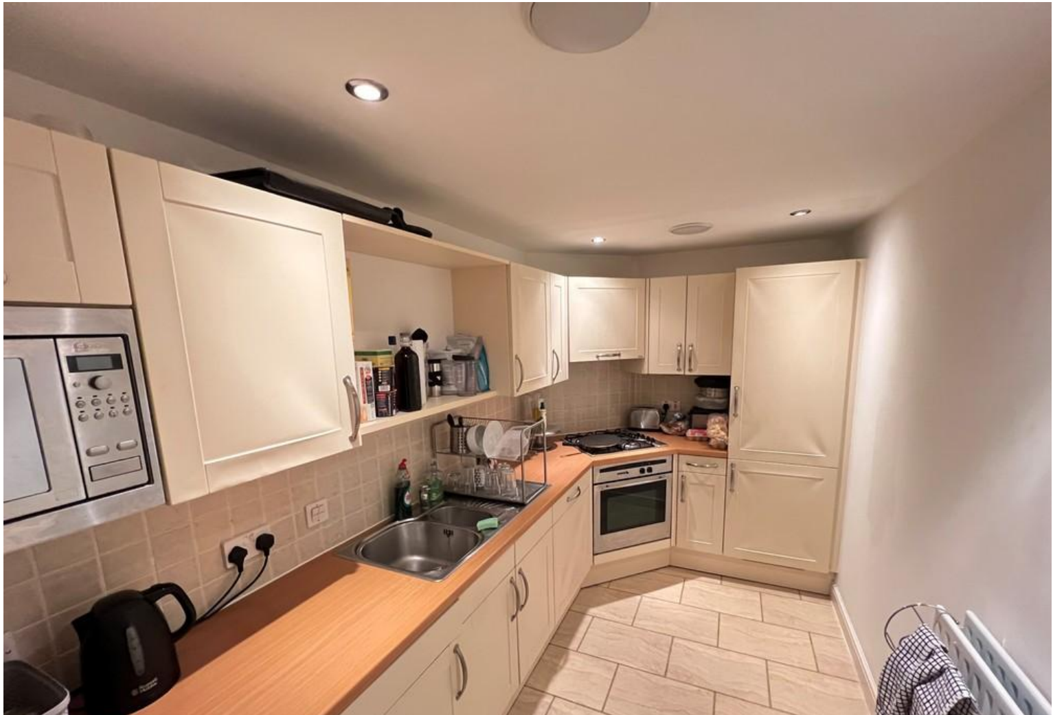
7 Copper Beeches, Meins Road, Blackburn