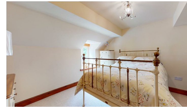
BEDROOM TWO 3.91m x 3.63m (12'10" x 11'11")

Double glazed dormer window to the front and radiator.