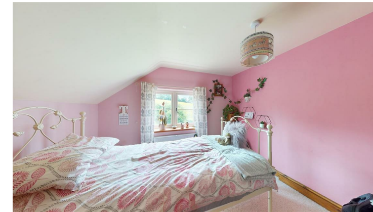
BEDROOM THREE 3.02m x 2.92m (9'11" x 9'7")

Double glazed window to the side elevation with views and radiator.