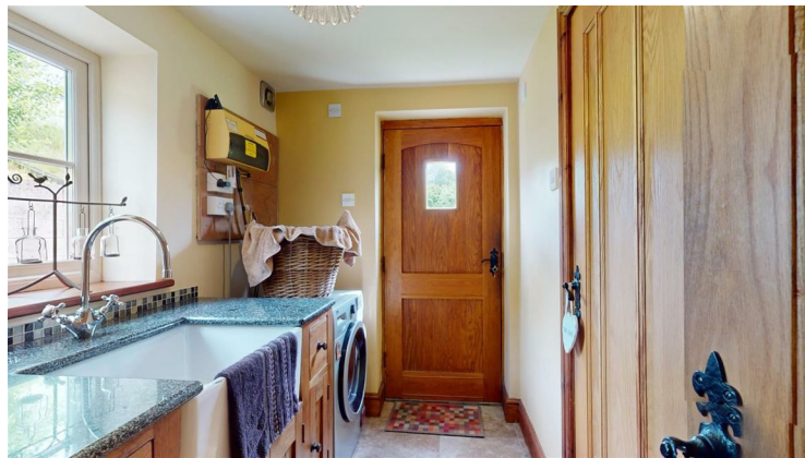
UTILITY ROOM 2.72m x 1.60m (8'11" x 5'3")

Oak fronted base cupboards and drawers with solid granite worktop with white enamel sink unit and mixer tap. Freestanding oil fired boiler, tiled floor, double glazed window, solid oak exterior door, radiator, plumbing for washing machine and internal door to shower room.