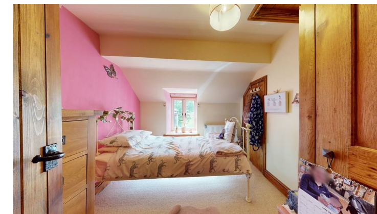
BEDROOM FOUR 2.92m x 2.67m (9'7" x 8'9")

Double glazed dormer window to the front with views, loft access, radiator and airing cupboard.