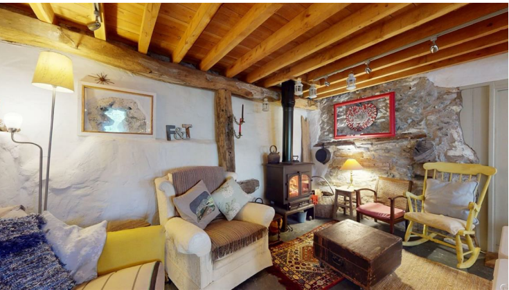
The owners have developed the ground floor to provide a splendid room with adjoining workshop and rooms above. It provides panelled door leading into the room, painted beamed ceiling and walls. It has a large 'Clearview wood Stove' on a raised plinth together with exposed wall beams, concrete floor and electric light and power installed. Open tread steps lead to the first floor, and door into the workshop.