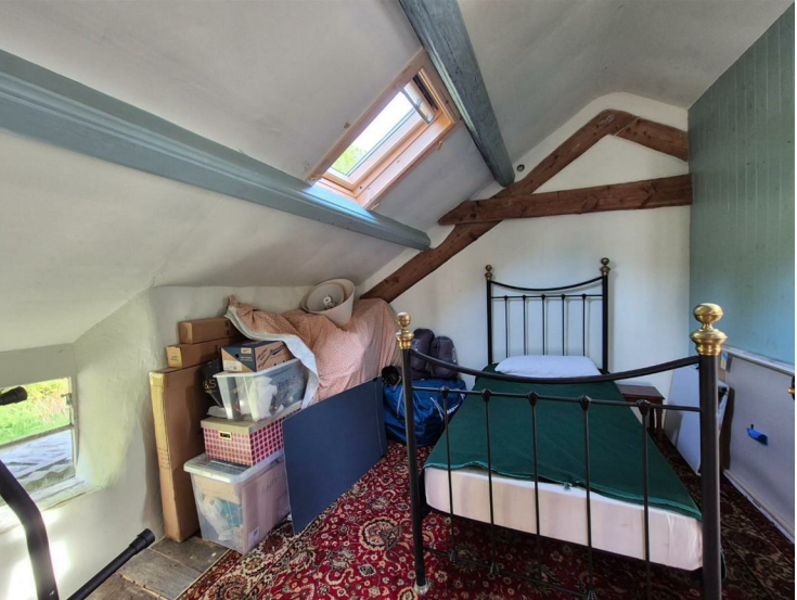
Vaulted ceiling with exposed purlins and double glazed Velux roof light, two low level windows, one a wrought iron single glazed window with low level sill, boarded floor.