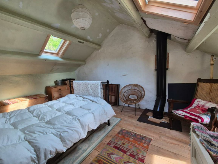
Vaulted ceiling with exposed purlins and two modern double glazed Velux roof lights, low level cottage style window, pine floorboarding.