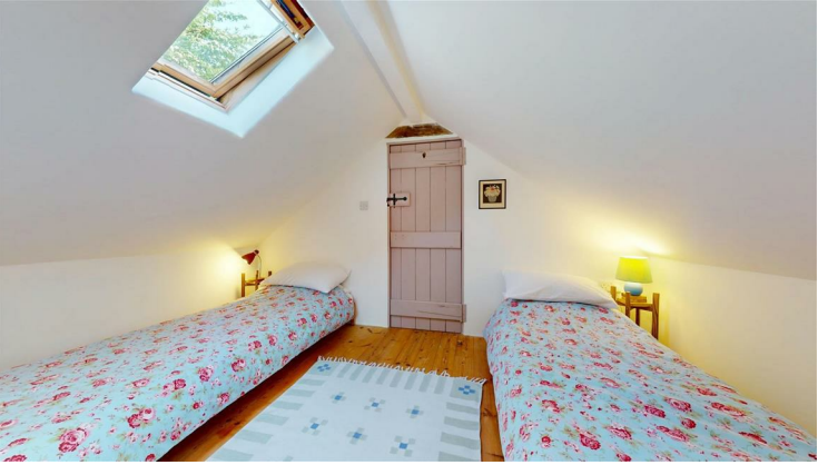
Vaulted ceiling with Velux roof light, cottage style double glazed window to gable, pine flooring, radiator.