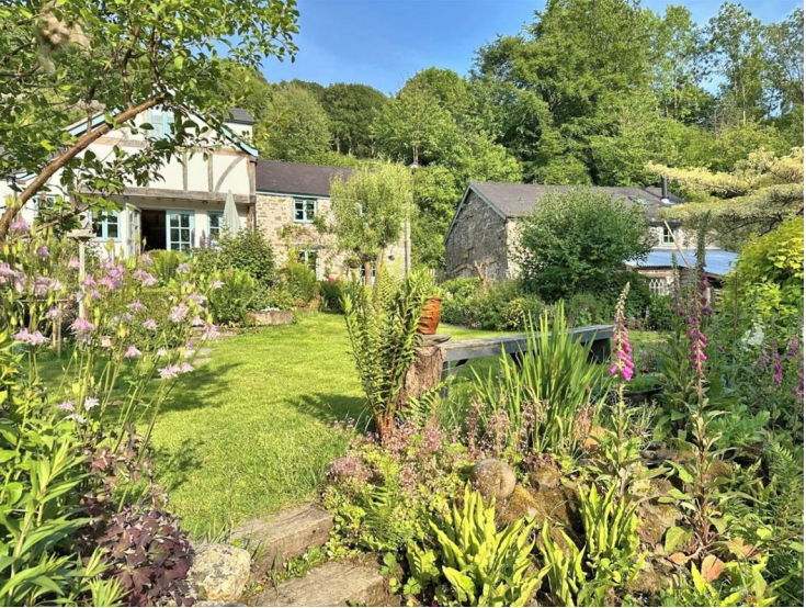
The property stands in an idyllic rural environment nestling in the heart of the picturesque valley of the River Aled approximately 0.6 mile from the hamlet of Brynrhydarian and some 2.5 miles from Llanefydd and Llansannan.