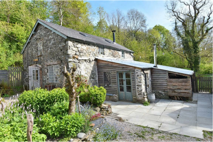
An original stone building, the former watermill, it provides an impressive building with potential for further conversion subject to consents.