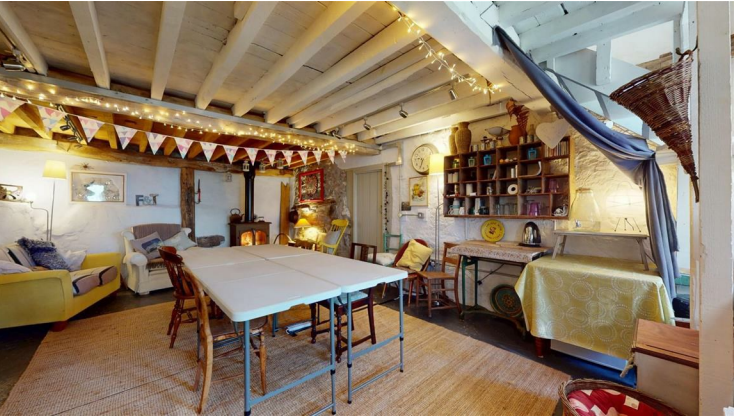
WORKSHOP 4.17m x 4.17m plus recess (13'8' x 13'8' plus recess) Benefiting from separate access to the front, it provides a very useful workroom with partially vaulted ceiling with electric light and power installed, single glazed windows overlooking the delightful woodland walk and grounds and a wood burning stove.