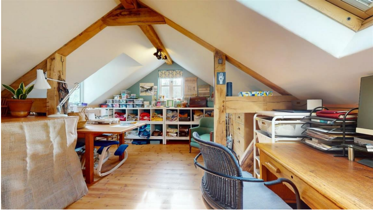
Presently used as a craft room, it has a vaulted ceiling with two Velux roof lights and two double glazed cottage style windows, pine flooring, panelled radiator.