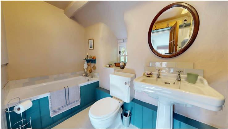
White suite comprising panelled bath, pedestal wash basin and low level WC, partially vaulted ceiling with painted purlin and chrome towel radiator. Double glazed cottage style window.