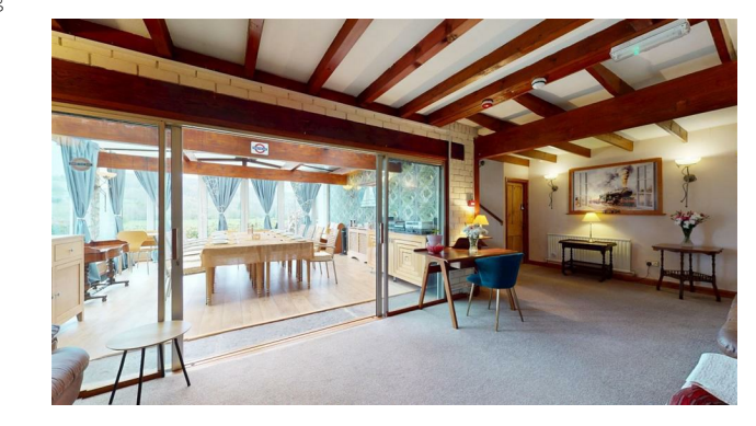
4.06m x 4.01m (13'4 x 13'2)

A large central room interconnecting with the main lounge and dining room, it has a beamed ceiling, wall light points, inset and glazed display cabinets with leaded glass and glass shelving, panelled radiator, box panelled