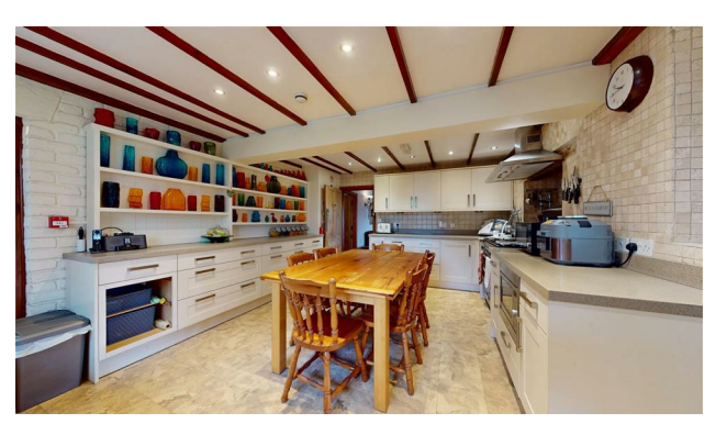
DAY ROOM 6.38m x 3.00m (20'11 x 9'10)

Refurbished with a modern range of base and wall mounted cupboards and drawers with an off-white finish to door and drawer fronts and contrasting stone effect working surfaces to include space for an LPG range cooker with a large extractor hood and light above, integrated Lamona microwave, pan drawers, void and plumbing for dishwasher, large stainless steel counter with two inset sinks and mixer tap, painted wall shelving to match together with beamed ceiling and downlighters, limestone effect mosaic tiled walling to the majority. Space for upright fridge/freezer.