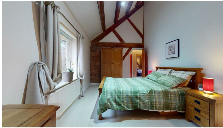
BEDROOM TWO 3.38m x 3.02m (11'1" x 9'11")

2 The Hay Barn Mold Road, Denbigh, Denbighshire, LL16 4BW