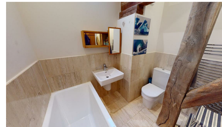
BATHROOM 2.29m x 1.96m (7'6" x 6'5")

Luxury white suite comprising panelled bath, wash basin and WC, part tiled walls and floor to a Travertine style, high vaulted ceiling with exposed timbers, purlins, Velux roof light, downlighters and chrome towel radiator.