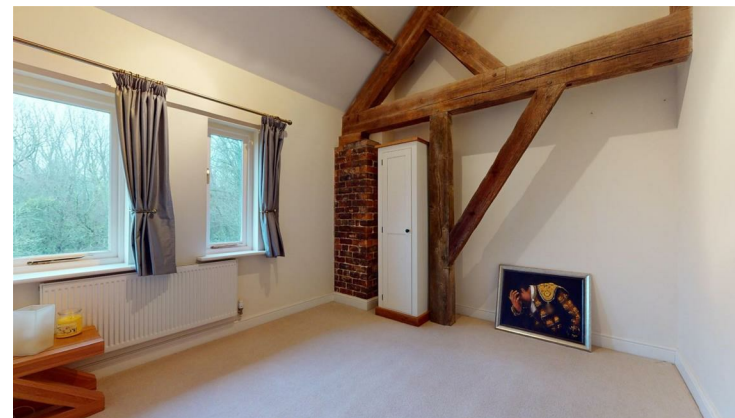
BEDROOM THREE 31.09m x 3.02m (102' x 9'11")

High vaulted ceiling with exposed purlins, rafters and brick pillar with two double glazed windows to front, panelled radiator.