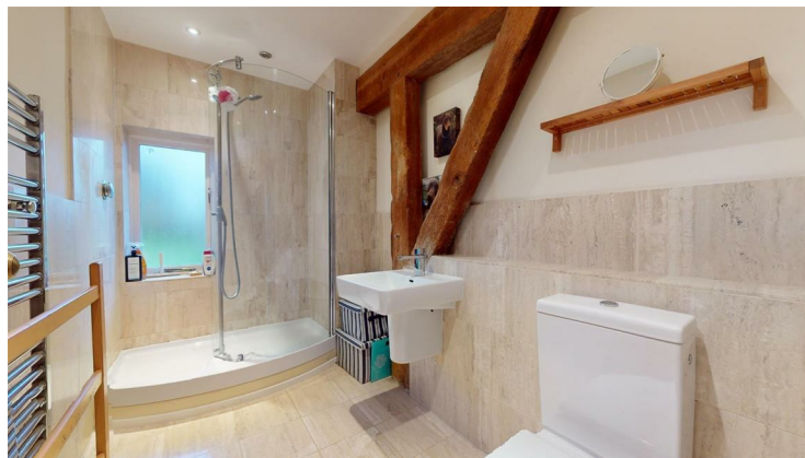
EN SUITE SHOWER ROOM 3.02m x 1.85m (9'11" x 6'1")

Double glazed window to rear with far reaching northerly and north westerly views over the gardens and countryside towards the Clwydian Hills, high vaulted ceiling with exposed A frame truss, wall beams, purlins and brick pillar, panelled radiator.