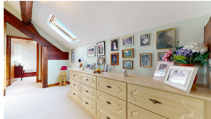
FIRST FLOOR LANDING 3.99m x 1.80m (13'1" x 5'11")

A large central landing with vaulted ceiling, exposed purlins and roof timbers and double glazed Velux rooflight. Fitted cabinet to one wall providing a working surface and extensive drawers, panelled radiator, built in double door airing cupboard with a large pressurised cylinder together with slatted shelving.