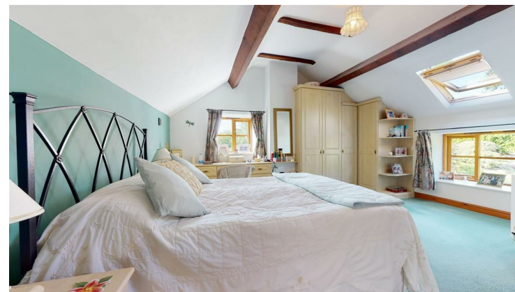
BEDROOM ONE 5.11m max x 4.67m max (16'9" max x 15'4" max)

A very spacious room with vaulted ceiling together with exposed purlins and rafters, it benefits from a range of fitted wardrobes providing hanging rails and shelving, chest of drawers and dressing table, dual aspect with two double glazed windows, Velux rooflight, panelled radiator.