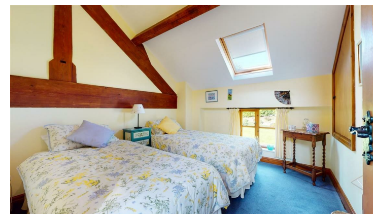
BEDROOM TWO 3.15m x 2.97m (10'4" x 9'9")

Double glazed window to front, partially vaulted ceiling with Velux rooflight, exposed wall and ceiling timbers, low level