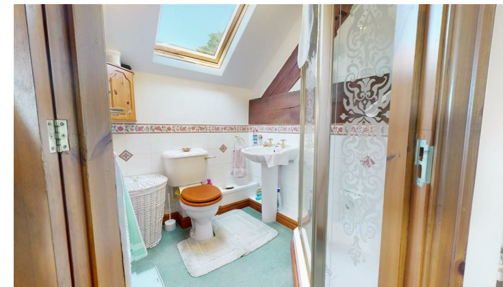
EN SUITE SHOWER ROOM 2.06m x 1.68m (6'9" x 5'6")

White suite comprising corner cubicle with high output shower, pedestal wash basin and WC, part tiled walls, exposed roof timbers, Velux rooflight, panelled radiator.