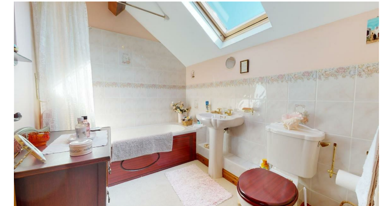
BATHROOM 2.54m x 2.06m (8'4" x 6'9")

White suite comprising panelled bath with combination shower and tap unit, pedestal wash basin and WC, part tiled walls, vaulted ceiling with Velux rooflight, exposed roof timbers, extractor fan, panelled radiator.