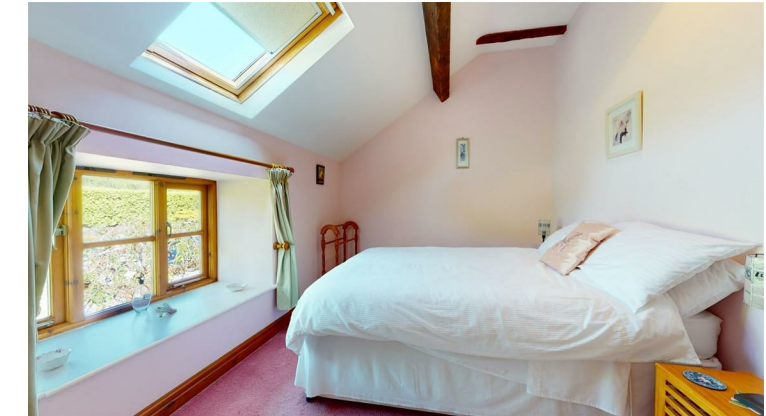
BEDROOM THREE 3.81m x 1.52m (12'6" x 5')

Vaulted ceiling with Velux rooflight, low level double glazed window, exposed roof and wall timbers, panelled radiator.