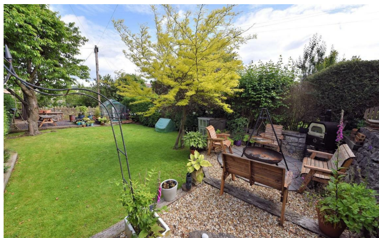
Enclosed front lawned garden with established hedging to

either side, gravelled and paved areas, stone walling and various mature trees. A shared pathway provides access down to Tan y Gwalia.