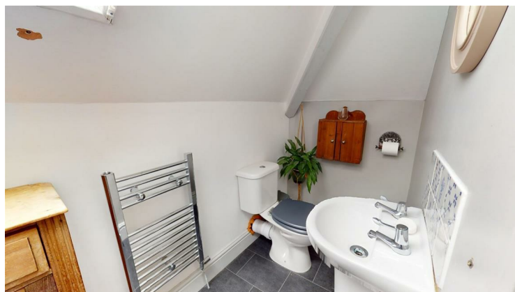
Fitted with a white suite comprising; low flush WC and pedestal wash basin. Chrome tiled radiator.