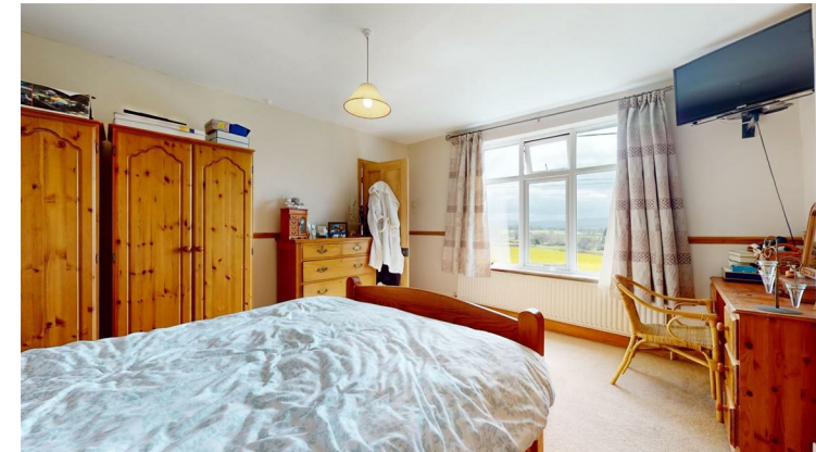
BEDROOM THREE 4.14m x 3.23m (13'7 x 10'7)

Double glazed window, panelled radiator.