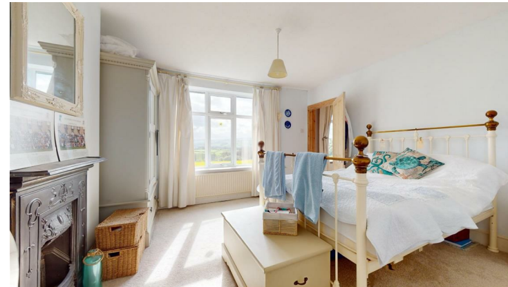
BEDROOM ONE 4.19m x 3.86m (13'9 x 12'8)

Ornate cast iron fireplace, double glazed window with splendid views in a west and southerly direction along the vale, panelled radiator.