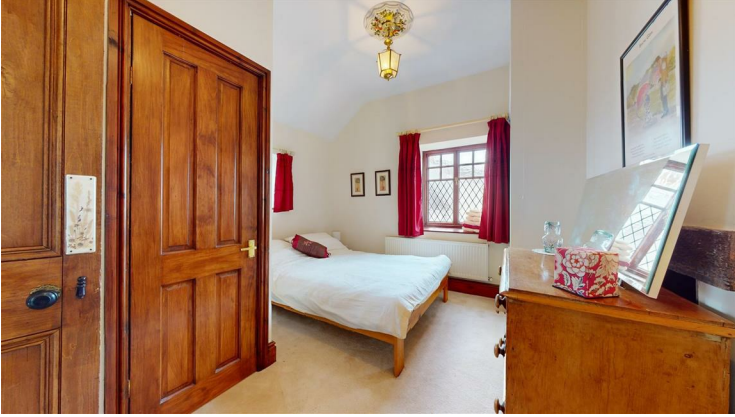
BEDROOM TWO 4.17m x 3.81m (13'8 x 12'6)

Double glazed window, walk in shower cubicle with bi fold screen, tiled walls and Triton shower, separate cloakroom with modern cabinet with integrated wash basin and low level WC. Panelled radiator.