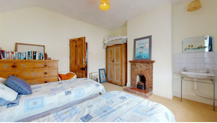
BEDROOM FOUR 3.81m x 3.73m (12'6 x 12'3)

Leaded window, wash basin with stand and tiled splash, briquette fireplace and raised hearth, panelled radiator.