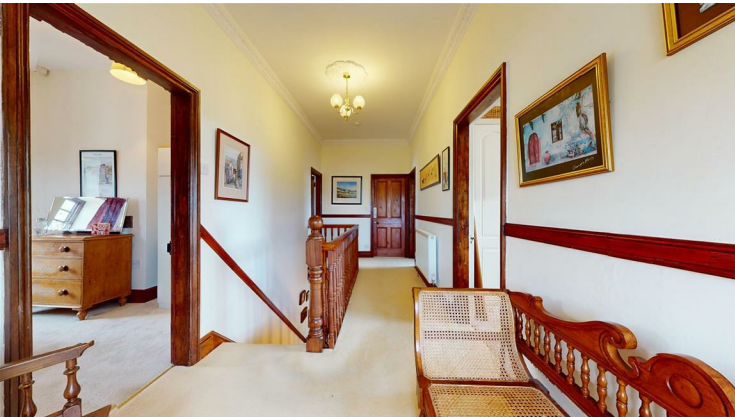
FIRST FLOOR LANDING 6.22m x 2.18m (20'5 x 7'2)

Large central landing with vaulted ceiling with moulded coving, dado rail, panelled radiator.