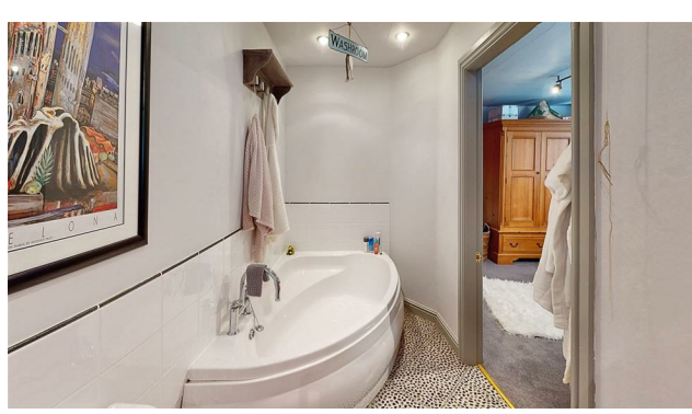
White suite comprising corner bath, pedestal wash basin and wc. Part tiled walls, ceiling downlighters with extractor fan and towel radiator.