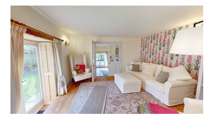
SUN LOUNGE 5.28m x 4.45m (17'4" x 14'7")