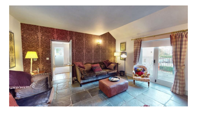
DAY LOUNGE/STUDY 4.93m x 4.67m (16'2" x 15'4")

An elegant room with a fine solid stone slab floor with underfloor heating, it has a large inglenook style fireplace with recess, raised hearth and a contemporary log effect gas fire. TV point, partially vaulted ceiling, double glazed french doors opening to a secluded patio and further window to the rear.