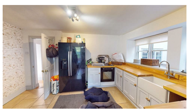
4.98m x 4.11m (16'4" x 13'6")

A bespoke range of fitted base and wall units to include pantry cupboard with shelving. Solid beech working surfaces to include a white glazed Belfast sink, inset four-ring electric hob, integrated oven, space and plumbing for American style fridge freezer, Travertine flooring, double glazed windows and a stable door leading to the rear (single glazed window to one side). Panelled radiator.