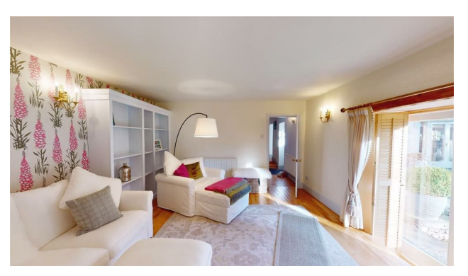
An attractive and well lit room with double glazed french door opening to the south facing patio and gardens with bespoke light wood shutters, fitted open fronted bookshelves, matching floor to the hall, wall light points and panelled radiator. Twin panelled and glazed doors lead through to the sun lounge.