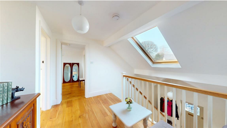
FIRST FLOOR LANDING 3.15m x 2.41m (10'4" x 7'11")

A pleasant seating area with a large Velux double glazed roof light to the front with views across to the village church. Solid oak flooring, traditional panelled interior doors lead to all rooms and radiator.