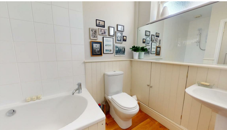
BATHROOM 2.84m x 1.93m max overall (9'4" x 6'4" max overall)

A well appointed bathroom with three piece suite comprising panelled bath with Triton electric shower, semi-pedestal wash basin with mixer tap and low flush WC. Feature wood panelling with built-in storage, large fitted mirror, oak flooring, radiator, extractor fan and high level double glazed window.