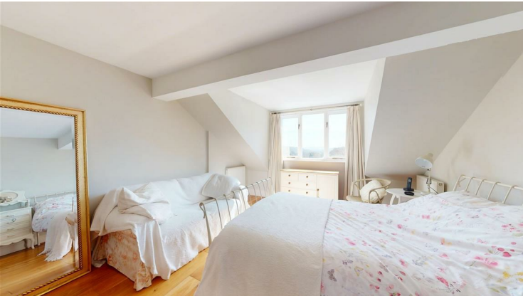
BEDROOM ONE 5.31m x 3.61m (17'5" x 11'10")

A spacious principal bedroom with double glazed dormer window to the rear with outstanding views over the valley across to Bryn Eirin and towards the Horseshoe mountain range in the far distance. Two panelled radiators, solid oak flooring and walk-in wardrobe.