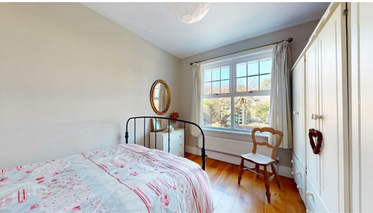
BEDROOM FOUR 3.61m x 2.97m (11'10" x 9'9")

Double glazed window to the front, solid oak flooring and radiator.