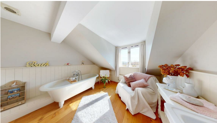
BATHROOM 3.43m x 3.10m (11'3" x 10'2")

A family bathroom fitted with a traditional three piece suite comprising oval shaped bath with traditional style mixer shower tap, pedestal wash basin and low flush WC. Feature wood panelling, solid oak flooring, radiator, extractor fan and double glazed window with open aspect.