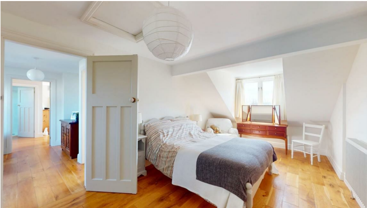
BEDROOM TWO 5.33m x 2.97m (17'6" x 9'9")

A double size room with double glazed dormer window to the rear with far reaching views, solid oak flooring, radiator, walk-in linen cupboard with slatted shelving and radiator, and further useful walk-in storage room/wardrobe with solid oak flooring, radiator and access to under eaves storage.