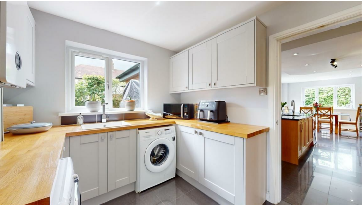
UTILITY ROOM 3.30m x 2.57m (10'10" x 8'5")

A large utility room with modern range of grey wood grain effect fronted base and wall units with solid oak worktops and inset composite sink unit with modern chrome finished mixer tap. Tiled splashback, integrated fridge and freezer, plumbing for washing machine, space for tumble dryer. Continuation of the high gloss tiled floor, radiator, double glazed window and modern Worcester gas fired central heating boiler. UPVC double glazed exterior door leads to a useful covered area extending to the side of the property measuring 21'11" x 4'7" with outside light and tap.