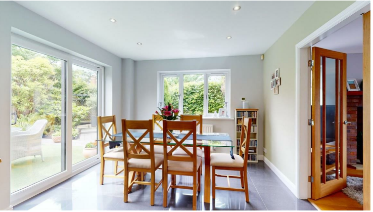
DAY ROOM 3.61m x 2.95m (11'10" x 9'8")