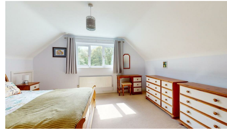
BEDROOM ONE 4.39m x 4.09m (14'5" x 13'5")

Double glazed window to the front with pleasant views across to surrounding woodland, access to under eaves storage and radiator.