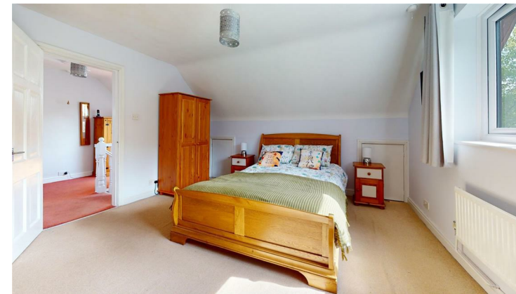
BEDROOM TWO 5.21m x 2.51m reducing to 2.21m (17'1" x 8'3" reducing to 7'3")

Double glazed window to the front with pleasant views across to surrounding woodland, access to under eaves storage and radiator.