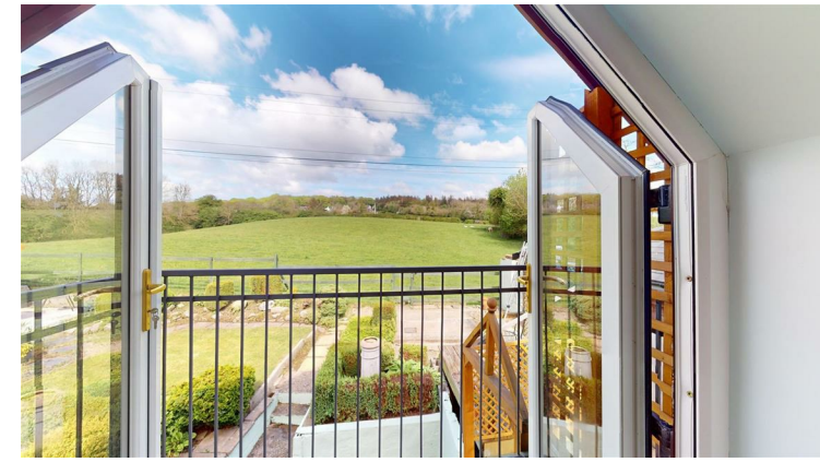
EN SUITE 2.16m x 1.85m (7'1" x 6'1")

A double size room with UPVC double glazed French doors leading out onto a small balcony with views over the surrounding countryside. Shaped ceiling with two Velux double glazed roof lights, two radiators, built in storage and internal door to en suite.