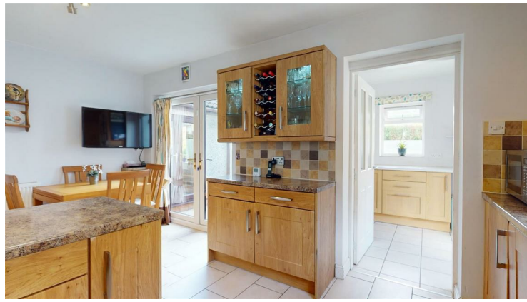
UTILITY ROOM 2.46m x 2.31m (8'1" x 7'7")