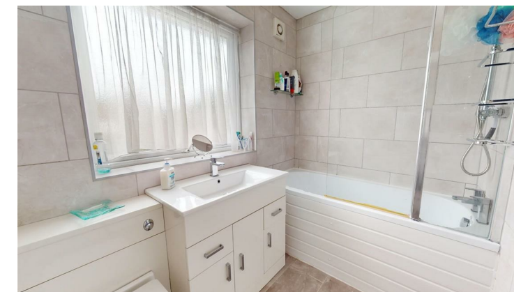
A modern well appointed fully tiled bathroom comprising panelled bath with mains shower valve and glazed screen, vanity wash basin with white vanity drawers beneath and low flush WC with concealed cistern. Attractive tiled walls with matching tiled floor, chrome towel radiator and double glazed window with frosted glass.