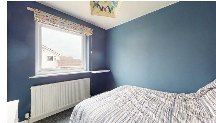
A double size room with double glazed window and radiator.