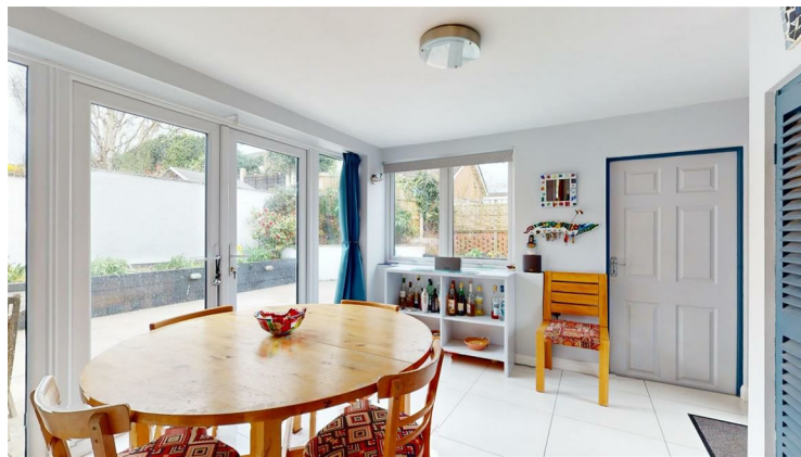
A well lit room with double glazed windows and French doors providing access to the adjoining courtyard, continuation of the tiled floor, built in shelved pantry cupboard, further built in cupboard housing the gas fired central heating boiler, double glazed exterior door to the driveway and internal door to the garage. Two wall light points and radiator.