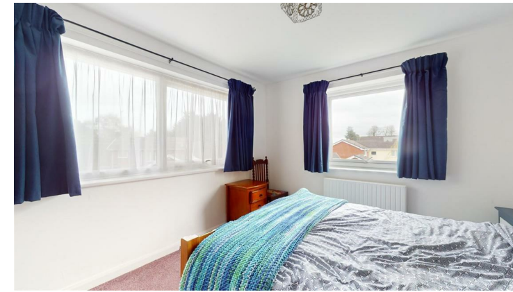
A dual aspect room with two double glazed windows with views over the surrounding area and radiator.