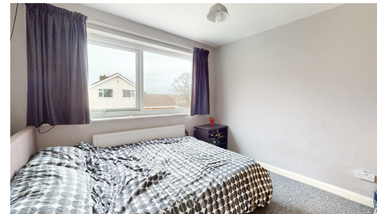
Double glazed window and radiator.