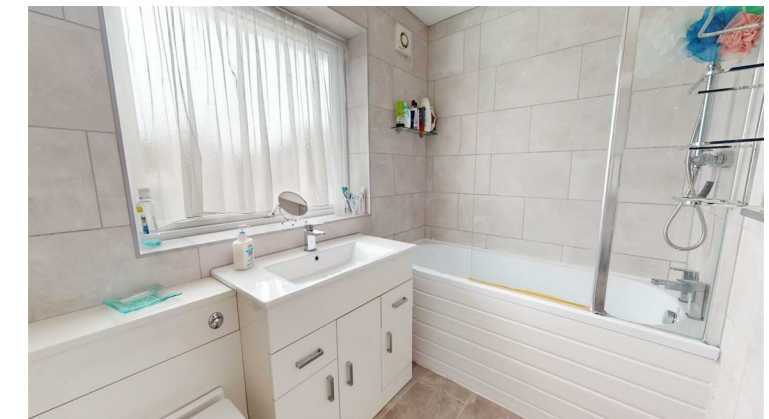
A modern well appointed fully tiled bathroom comprising panelled bath with mains shower valve and glazed screen, vanity wash basin with white vanity drawers beneath and low flush WC with concealed cistern. Attractive tiled walls with matching tiled floor, chrome towel radiator and double glazed window with frosted glass.