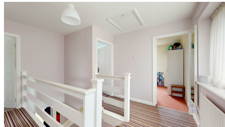
Double glazed window, loft access and radiator. White panelled interior doors lead to all rooms.