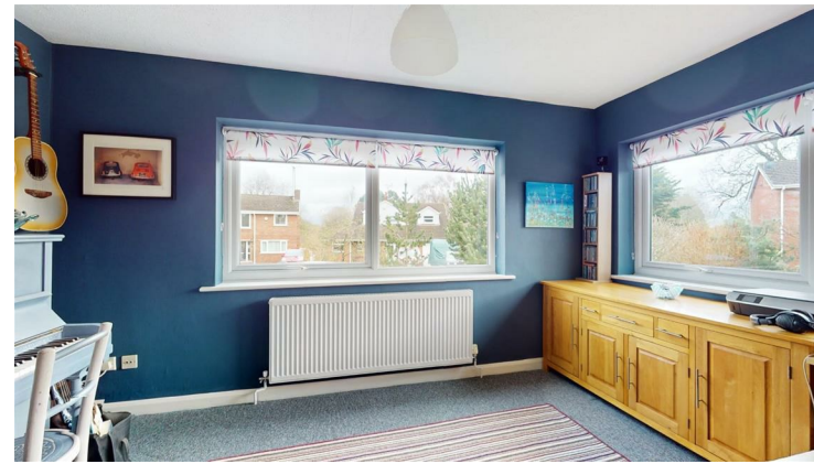
A dual aspect room with two large double glazed windows to the front overlooking the gardens and radiator.