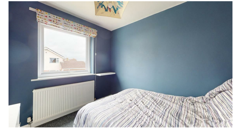
A double size room with double glazed window and radiator.