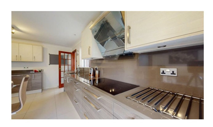
UTILITY 1.96m x 2.90m (6'5" x 9'6")