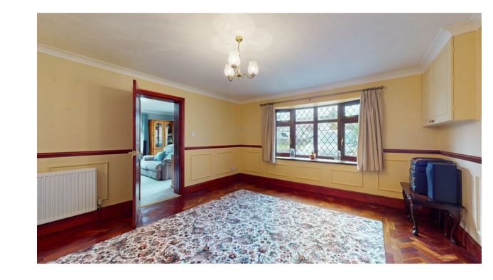
STUDY 2.69m x 2.90m (8'10" x 9'6")

Double glazed leaded effect bow window to the front, feature wood panelling, coved ceiling, wall light points, parquet woodblock flooring to part, double panelled radiator, electricity fuse box in cupboard and TV aerial point. Internal door leading through to the utility room and kitchen.