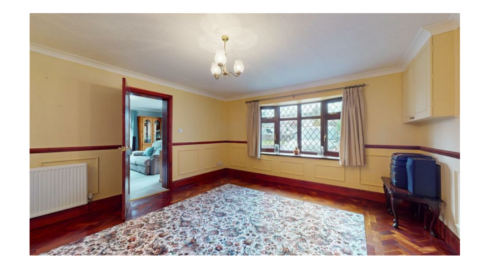
STUDY 2.69m x 2.90m (8'10" x 9'6")

Double glazed leaded effect bow window to the front, feature wood panelling, coved ceiling, wall light points, parquet woodblock flooring to part, double panelled radiator, electricity fuse box in cupboard and TV aerial point. Internal door leading through to the utility room and kitchen.